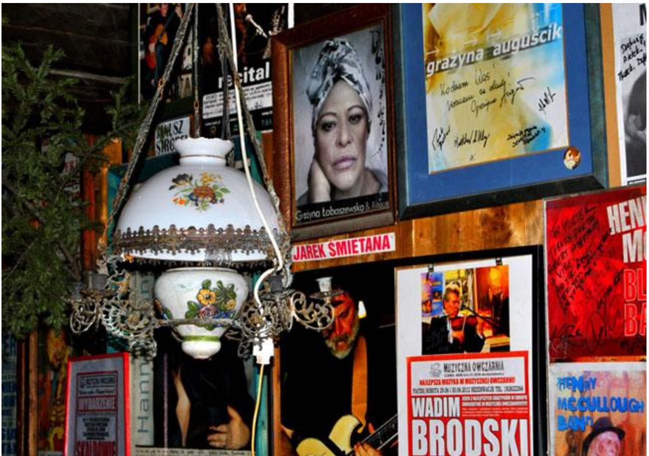
Then they went to Koliba to unpack their things, take some rest after the journey and prepare for the performance.