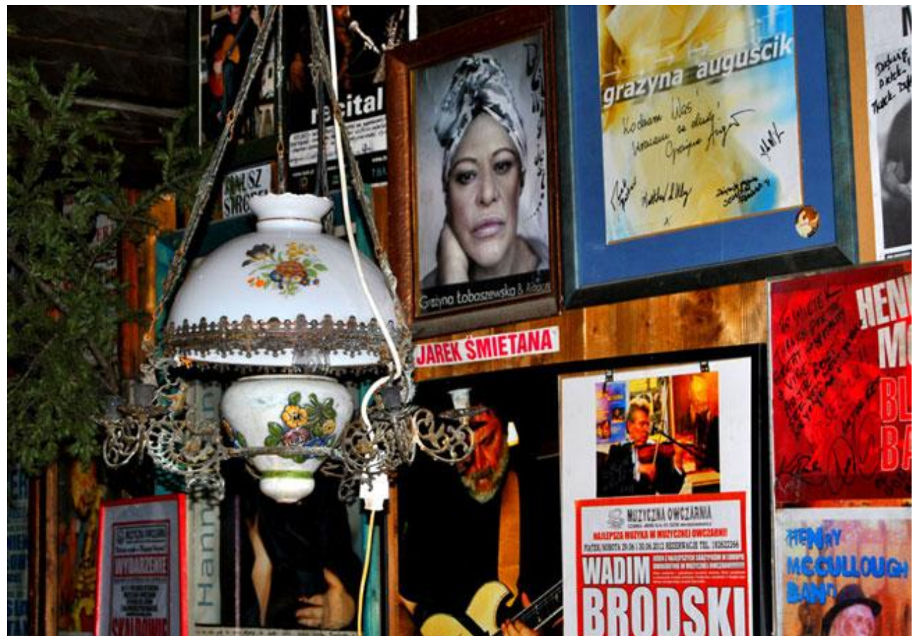
Then they went to Koliba to unpack their things, take some rest after the journey and prepare for the performance.