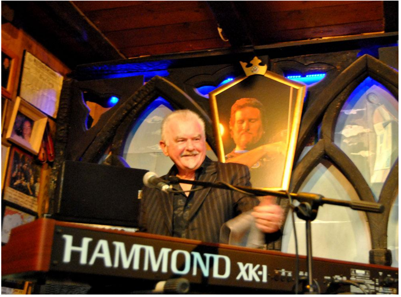
There were chronologically: Baby Let Me Take You Home, It's My Life, Bright, I'm Crying, She Said, Bring It On Home To Me, Don't Bring Me Down, I Belive, Autcast, Big Boss, Don't Let Me Be Misunderstood, Night Time, Spell, C.C, Halleluya, Road Runner, Inside, Roundt, Club A Go, Place, Boom Boom, Walket.