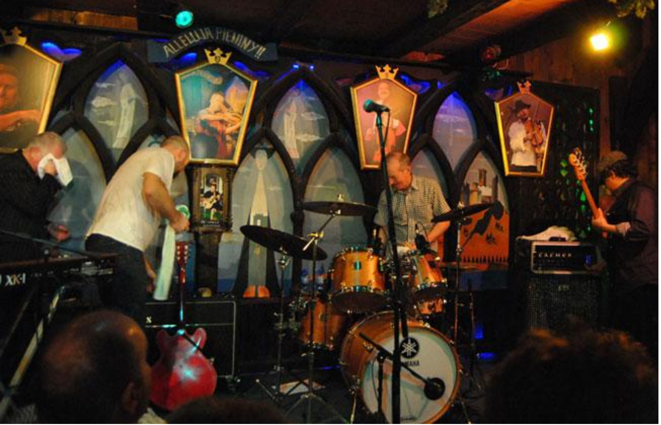
When they finished the concert and took a gasp, everyone wanted to shake hands with them, talk for a while and congratulate on this fantastic show. Everybody could get autographs and take photos with the artists. They said that they